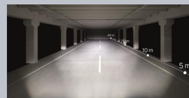
Low beam light – shines approx. 50 m