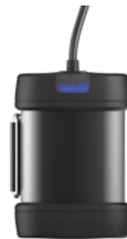
Battery pack. Charge status display via five blue LEDs: One LED corresponds to 20 % capacity.